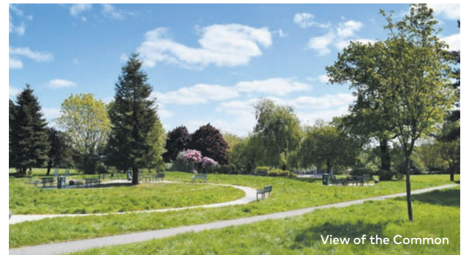
View of the Common