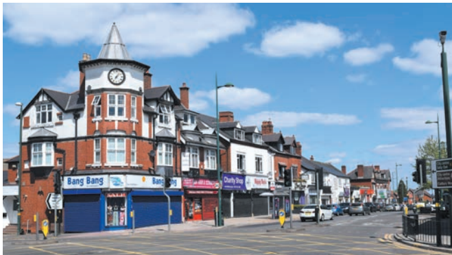
The Bristol Road South

For those willing to make the climb, the roof level of the Shopping Centre car park provides fine views across Northfield and Birmingham.