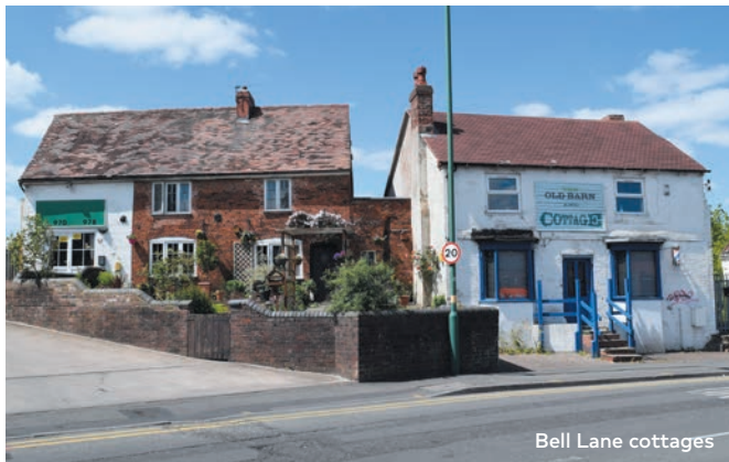
Bell Lane cottages