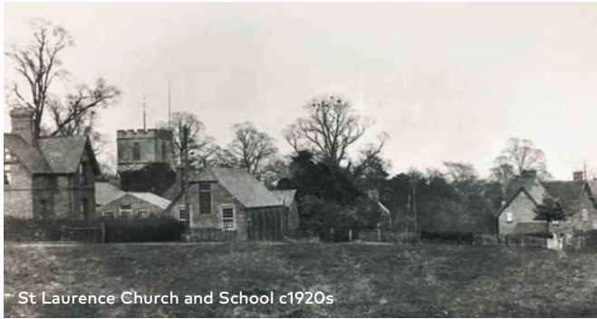
St Laurence Church and School c1920s