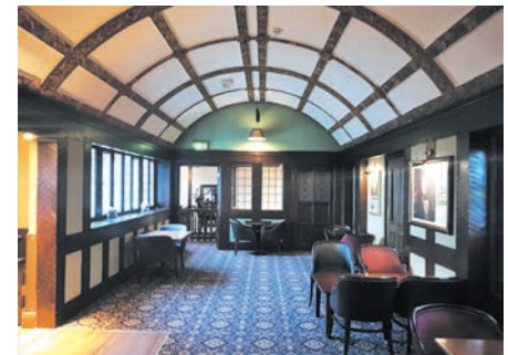
Carved wooden bracket and pub interior