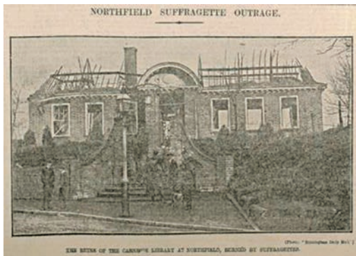
Newspaper cutting covering the arson attack on the Library in 1914