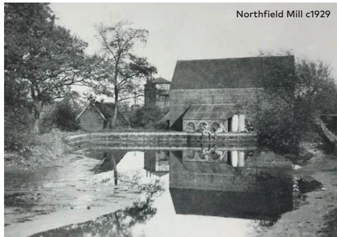
Northfield Mill c1929