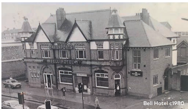
Bell Hotel c1980

The new village originally grew up around the crossroads where the Bristol Road met Bell Lane and Church Road. The Bluebell Inn on Bell Lane was a coaching station for travellers until a new Bell Inn was built on the Bristol Road in 1803. This was replaced by yet another version in 1904 which was itself demolished in 1984.