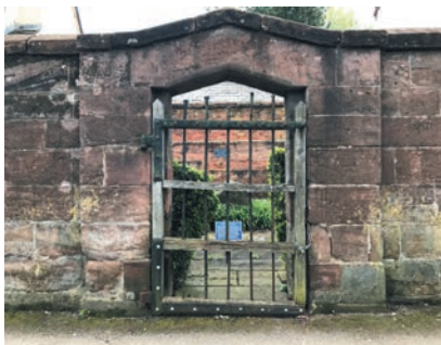
Above: The Great Stone Inn and The Village Pound