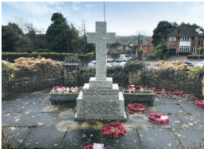
Royal British Legion Garden of Memory

Quarry Lane was the site of an old quarry which supplied the sandstone for St Laurence Church and some of the area's other early buildings.