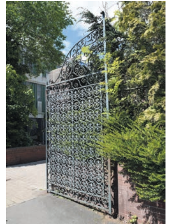
The original entrance gates are now located behind the Shopping Centre

In 1897 the land was laid out by the City Council as municipal recreation area to commemorate Queen Victoria's Diamond Jubilee. However, the landscape works were not actually completed until after 1904. Most of the land on which the park is located was gifted by the Cadbury family in 1905 and 1913.