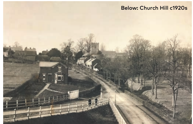
Below: Church Hill c1920s

Beech Tree Farm originally stood across the road from the cottages but this was demolished in the 1930s to make way for new housing.