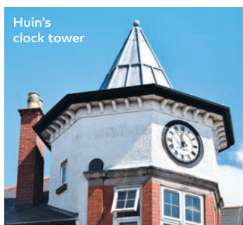
Huin's clock tower

Three late 18th century cottages survive on what remains of Bell Lane. The distinctive clock tower originally belonged to Huin's shoe shop and dates from 1907.