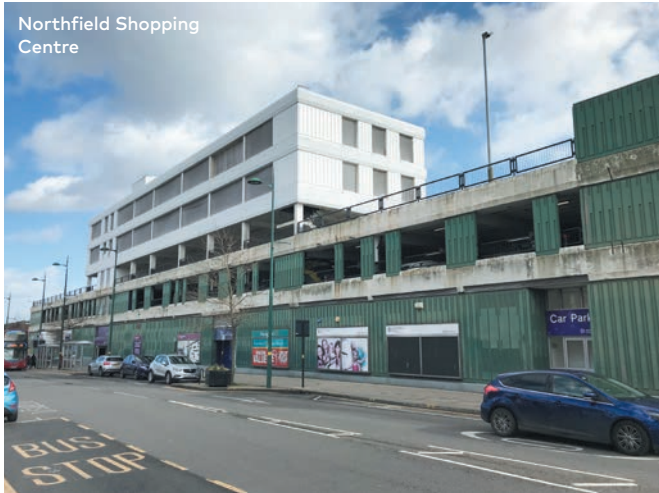
Northfield Shopping Centre

Northfield Shopping Centre was built in the 1974. Originally known as the Grosvenor Shopping Centre, its construction required the demolition of a significant number of old buildings and also the relocation of the main Bristol Road entrance gates to Victoria Common. The complex was renamed the Northfield Shopping Centre in 2005.