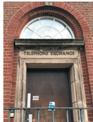
The Priory Telephone Exchange