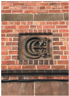
Left: George and Elizabeth Cadbury's entwined initials on the exterior of the building. Right: Northfield Institute today