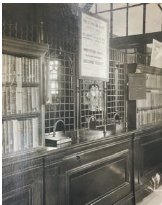
Library interior c1920s

The library was rebuilt in 1914 and remains a well-used community venue to this day.