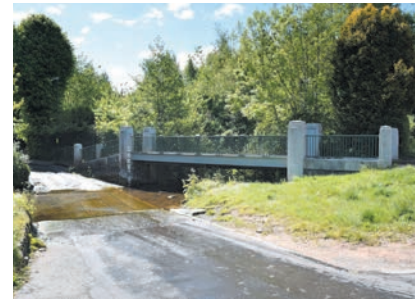
Top: Remains of the mill wheel pit Right: Mill Walk Ford