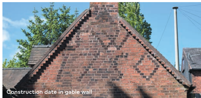
Construction date in gable wall