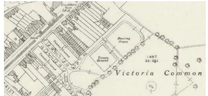
Detail of the 1939 OS map showing the original Bristol Road entrance to the Common