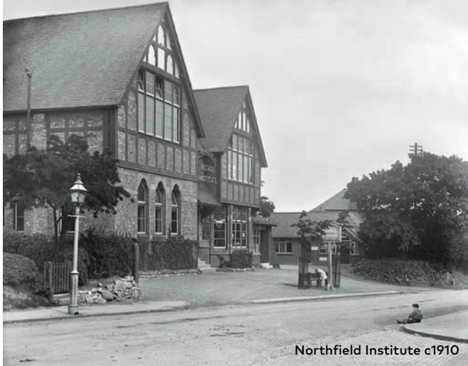
Northfield Institute c1910