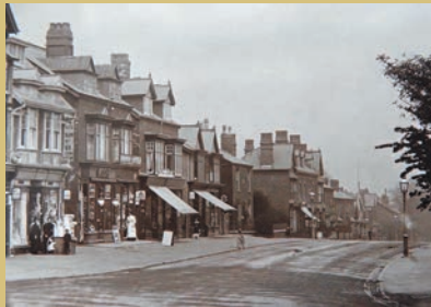
Bristol Road South c1915

A further impetus for development came with the building of the Birmingham to Gloucester railway line and the opening of Northfield station in 1870. The railway brought new industries to the area from the centre of Birmingham and also enabled more people to buy homes locally and commute into the city.