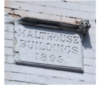
Malthouse Buildings date plaque

Most of the original Georgian and Victorian buildings were swept away during the 20th century. However, a few have survived, including the Malthouse Buildings of 1895.