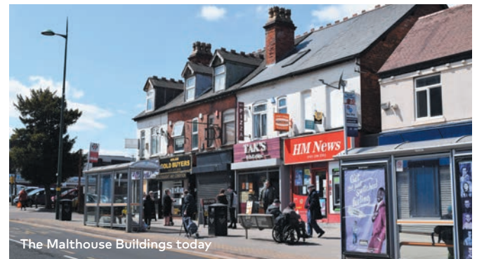
The Malthouse Buildings today