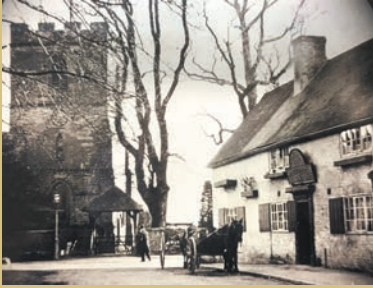
St Laurence Church and the Great Stone Inn c1900

Northfield has a long history of settlement dating back to the Iron Age.