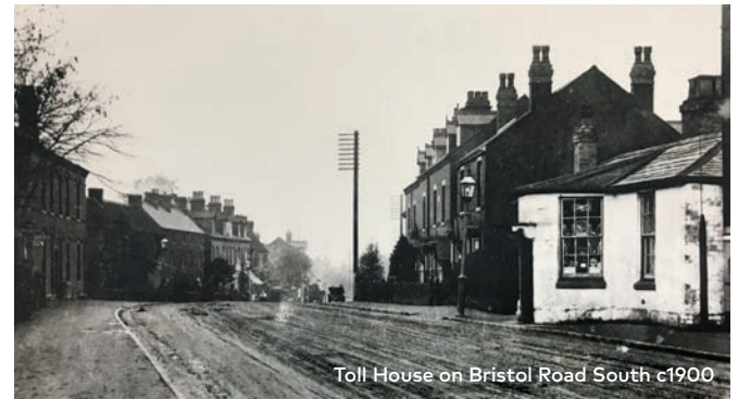
Toll House on Bristol Road South c1900