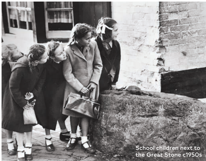
School children next to the Great Stone c1950s

Originally built as a timber-framed 'hall' house, the Grade II listed Great Stone Inn dates from the 15th century. It became an inn some hundred years later and was reclad in brick during the 18th century.