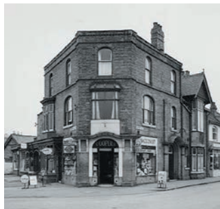
Left: Blocked entrance to 1892 central platform. Above: Former Temperance Hotel (now the Station Fish Bar)