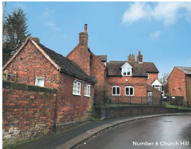
Number 6 Church Hill

Number 6 Church Hill was originally two separate nail makers' cottages. The date of their construction (1750) and the initials of their builder (AJW) are inscribed in darker bricks on the east gable end.