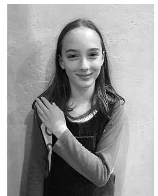
To indicate that you would like to receive a blessing

Gluten-free wafers are available. Please ask the person administering the bread.