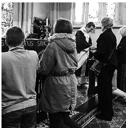
Standing or kneeling at the high altar

We receive Holy Communion or a blessing at the high altar or the chancel step.